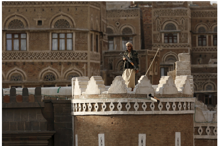
A Houthi fighter stands guard in Sanaa and secures the site of a demonstration by Houthis against the Saudi-led air strikes (1 April 2015).

After the "Yemeni Revolution" of 2011, power struggles among the country's political elites continued. Just as in Tunisia and Egypt, the opposition in Yemen also protested the authoritarian rule of President Ali Abdullah Saleh, who had been in power in Sana'a since 1978. The conflict